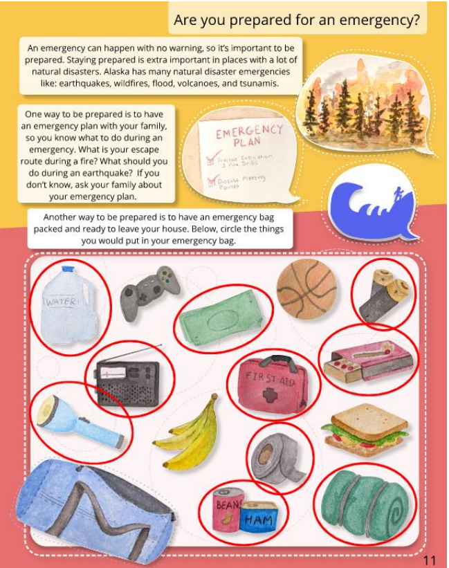
Page 11 – Are you prepared for an emergency?

Words include: BREATHE WINDOWS ALERT WOOD STOVES POLLUTE LOCKED UP CHEMICALS INDOOR AIR