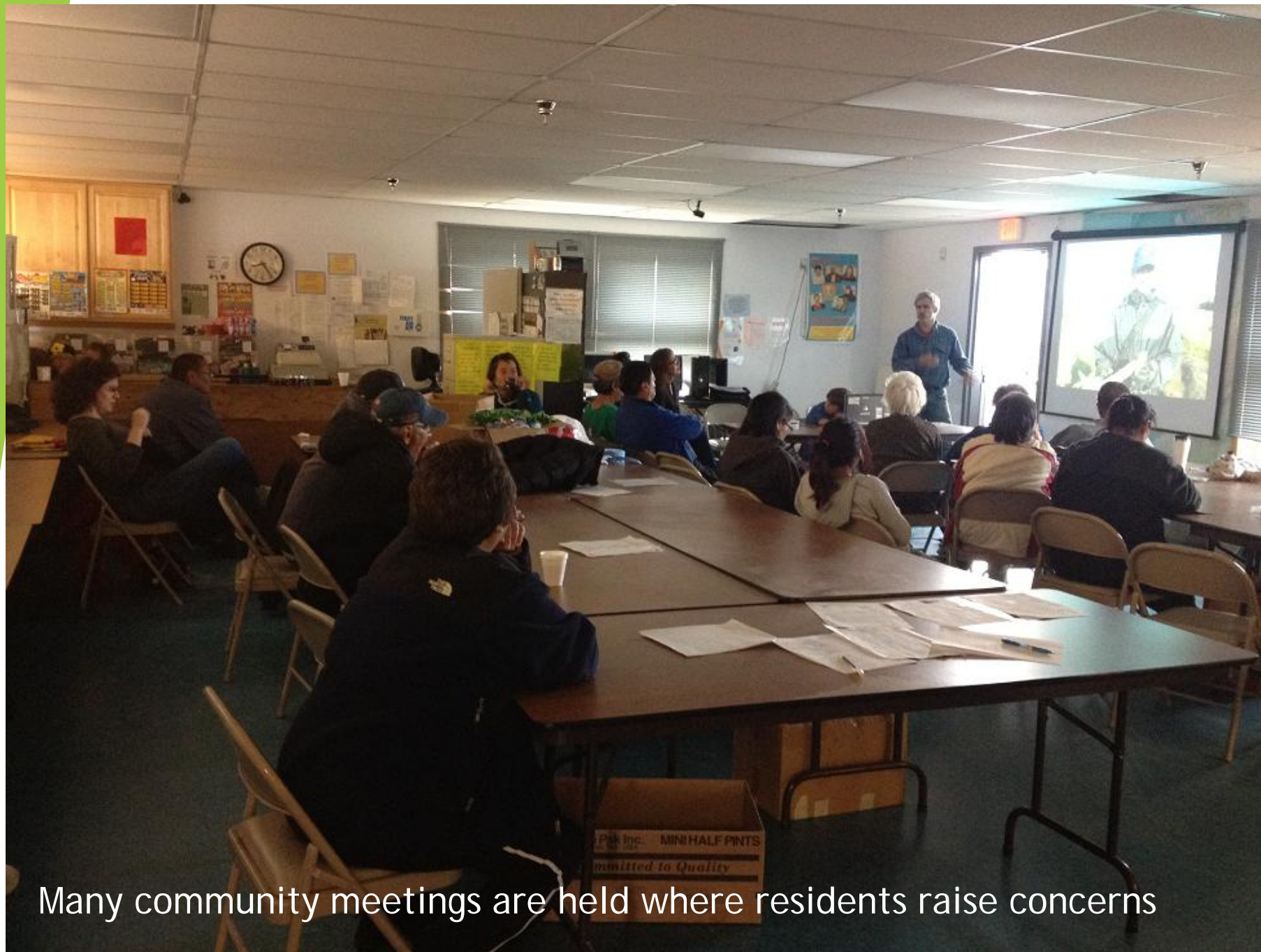
Many community meetings are held where residents raise concerns