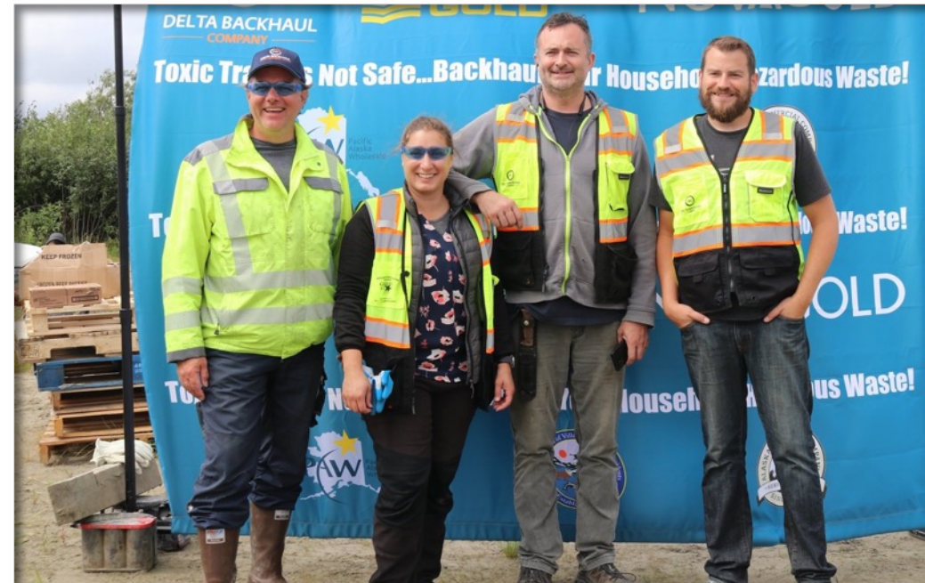
Delta Backhaul Company